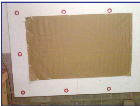
Craft paper ripples and loses dimensional accuracy. Pencil lines don't provide enough contrast.